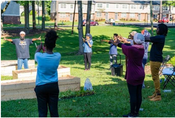
Starting out with a meditation