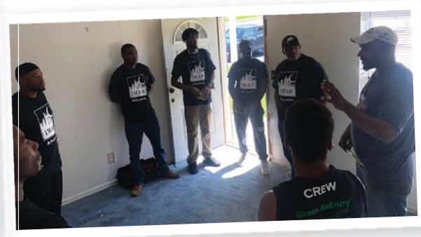
Teaching construction skills

In January 2016, the Inner-City Muslim Action Network (IMAN) expanded to the Atlanta metro area. Green Re-Entry is the flagship program of I.M.A.N, directly serving “returning citizens”. The program offers a holistic regiment including transitional