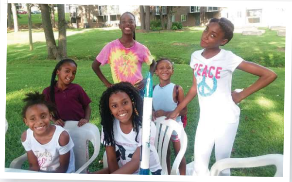
Preparing the rocket

Join us every Friday at 5:00 pm in the park for more learning and more fun.