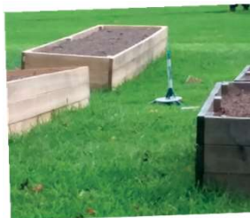
Launching the rocket