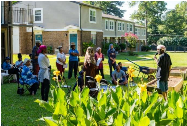
Reviewing what we learned

If you are interested in gardening or just want to learn more, don't miss our next workshop with Ras Kofi! See upcoming events for more details.