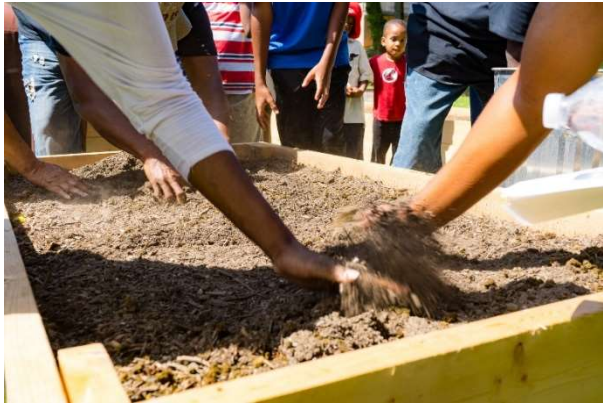
Preparing the soil