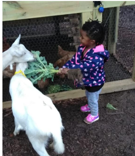
Feeding the goats