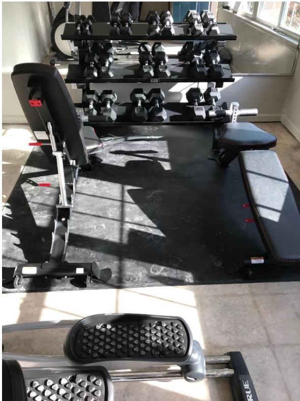
Dumbbells, Benches and Elliptical