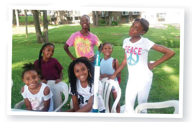
Preparing the rocket

Join us every Friday at 5:00 pm in the park for more learning and more fun.