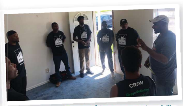
Teaching construction skills

In January 2016, the Inner-City Muslim Action Network (IMAN) expanded to the Atlanta metro area. Green Re-Entry is the flagship program of I.M.A.N, directly serving "returning citizens". The program offers a holistic regiment including transitional