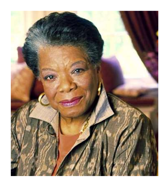
1928 (b) - 2014 (d)