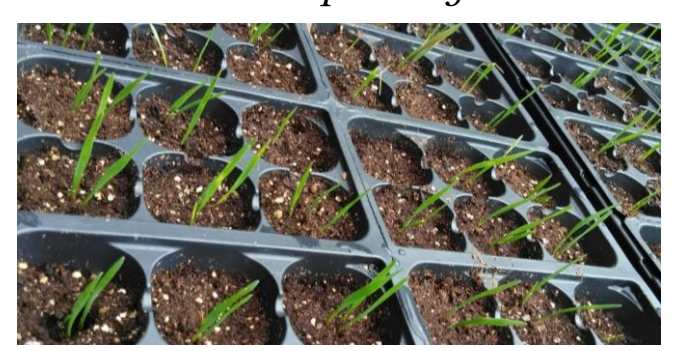
Germination & Sprouting