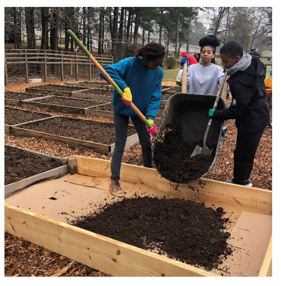
My World Youth Group